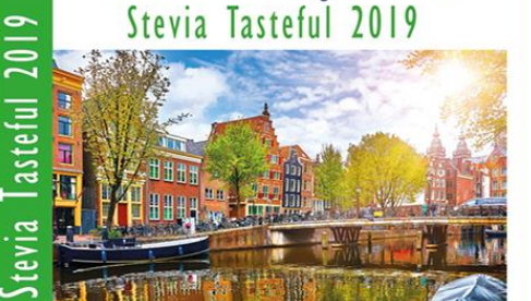
Science, Formulation & Strategies

Mövenpick Hotel Amsterdam City Centre October 24 - 25, 2019 - Amsterdam, Netherlands